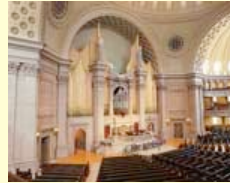
"The transmission medium has an affect on the propagation of sound."

Why should one bother trying to understand basic acoustics?